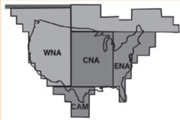
Figure 1. The regions used in describing climate change rates over the next century (adapted from AR-4, Working Group II, Chapter 2). (Published with the permission of the Intergovernmental Panel on Climate Change, see Carter et al., 2007)

Following AR-4, Working Group II we divide the Contiguous US into regions as shown in Figure 1.