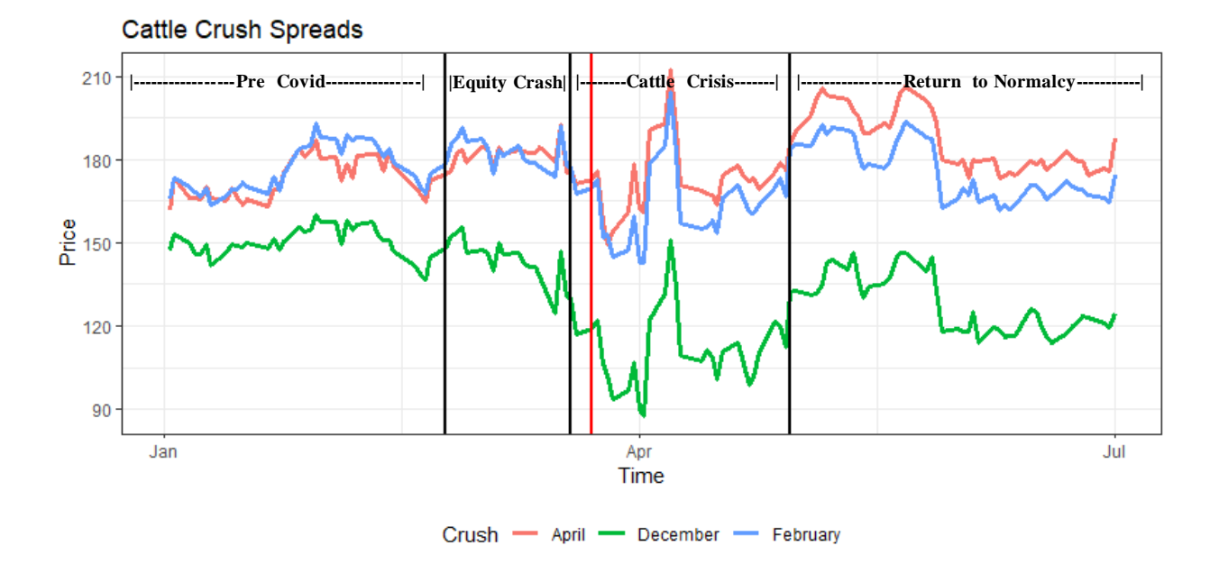
Figure 2: Graph of Cattle Crush Spread Breakpoints

Note: Breakpoints occurred at February 23<sup>rd</sup>, March 19<sup>th</sup>, and April 30<sup>th</sup>, shown as vertical black lines. The lines define the periods Pre Covid, Equity Crash, Cattle Crisis, and Return to Normalcy.